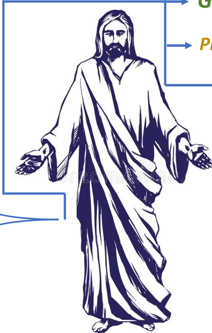
New Covenant God/Man